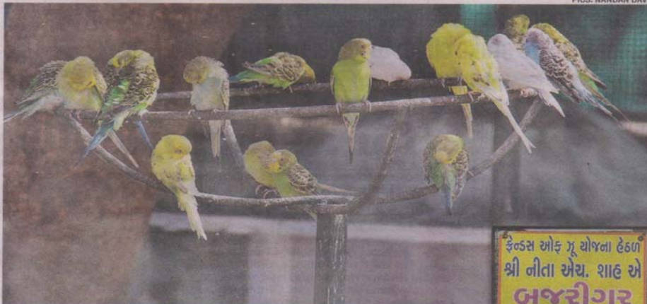
Visitors usually adopt birds as their upkeep is not expensive. Under Friends of Zoo programme the name of the adopter is displayed prominently (inset)