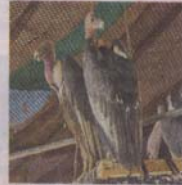
Top: Jackals and white-backed vulture (above) at the zoo