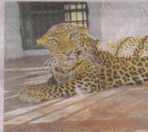
No takers for Leopardess Urvashi (left) and Marsh Crocodiles

"Friends of Zoo programme was not started with the purpose of collecting funds or charity for food and animal management. We get enough funds from the municipal corporation, Rs 7-8 crore for operational costs and equal amount for capital expenditure. Adoption programme covers just a fraction of the annual budget. The idea behind Friends of Zoo is to bring